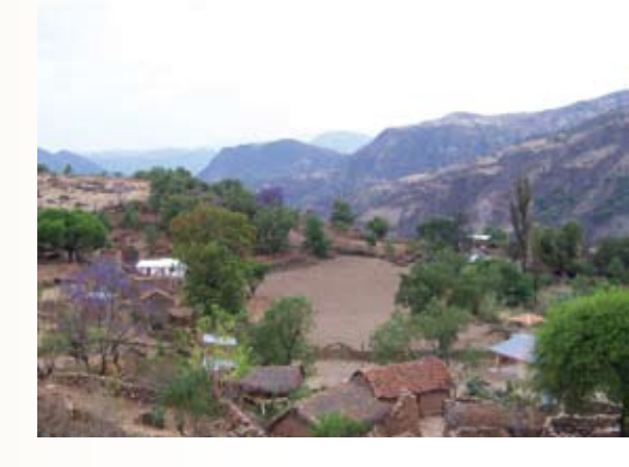
Overlooking the village of Yanayo. The large field in the center is unplanted due to water shortage, yet the trees are green and healthy indicating potential groundwater sources.

For more information, please email or visit: